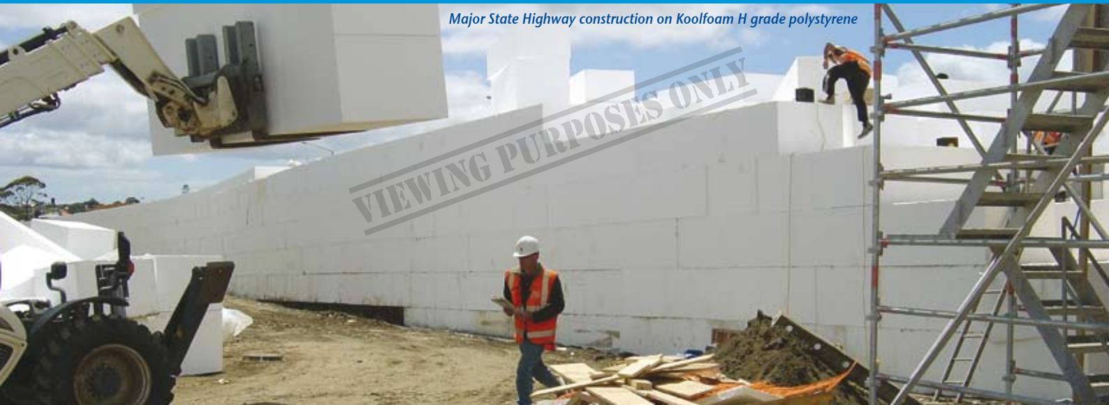
Major State Highway construction on Koolfoam H grade polystyrene

These blocks are the cut to size and predominately the product goes into permanent applications such as under concrete floors.