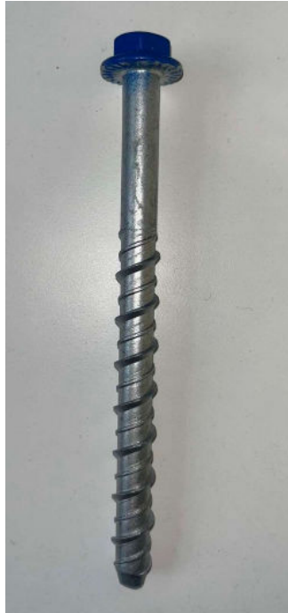
Figure 2 Bowmac M10 140mm Screw Anchors