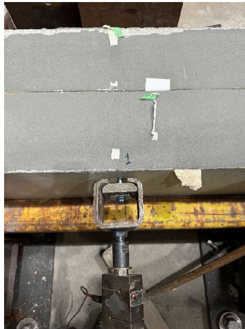
Figure 4 Test Setup for Anchors in Concrete