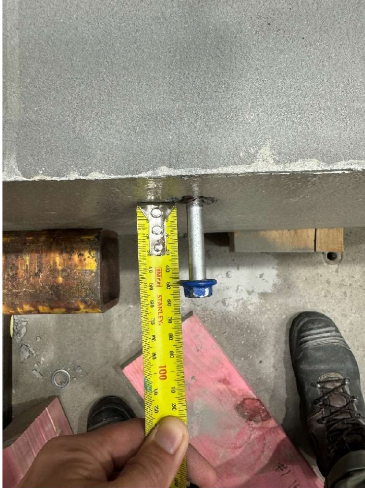
Figure 3 Concrete Anchor Embedment

Samples were connected to a hydraulic actuator via a rigid metal plate shown in Figure 4 through a steel plate that allowed the pair of anchors to be loaded simultaneously.