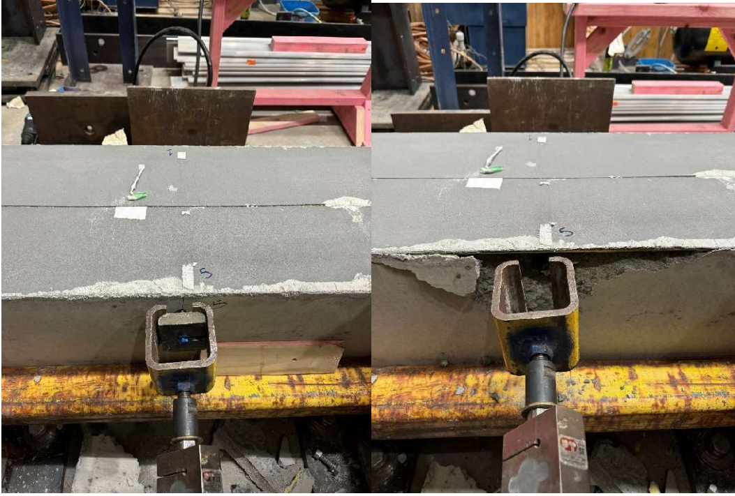
Figure 5 Failure Mode Tension (Concrete anchor)

Concrete anchor failure modes were consistently concrete cone breakout as shown in Figure 5 - Figure 7