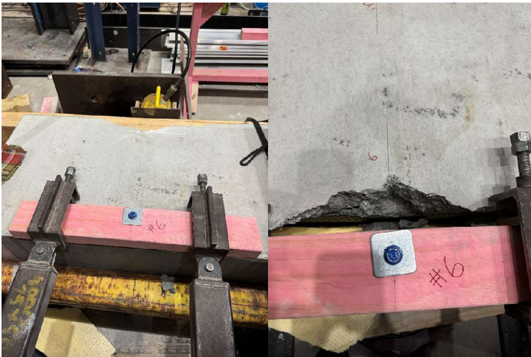
Figure 7 Failure Mode out of plane (Concrete anchor)